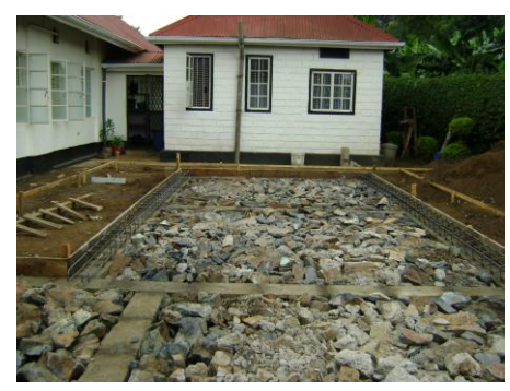
Figure: Foundation of the new building

consultations, an extension to the existing classroom, and a shaded open hut in the backyard for group counselling.